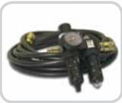
Pneumatic Driving Power Air powered for reduced operator fatigue and robust installation