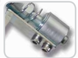
Nose Piece and Heavy-Duty Drive Rod For precise, consistent rivet driving