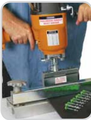
Dual Handles Provides an ergonomic grip and easy balance

Faster, more consistent rivet driving for heavy-duty rivet hinged splices. The Pneumatic Single Rivet Driver, along with our Flexco® SR™ fasteners and installation tools, speeds installation by up to 33%. A single trigger pull per rivet takes the guesswork out of rivet driving to give you a uniform long-lasting splice every time.