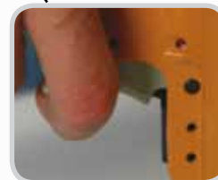
Single-Trigger Activation A single trigger pull sets rivets for quick and easy installation